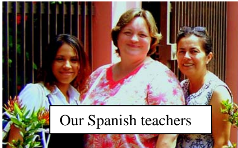
Our Spanish teachers

I can't believe it's been another month. Time is flying. It has been very busy and